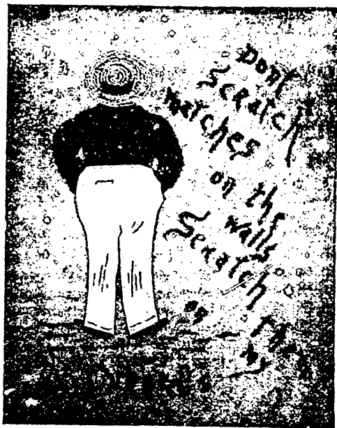
MATCH SCRATCHER DESIGN No. 26.

oval line. Then mount on the plain cardboard. The cardboard with the ring is secured to the back, and a small calen-