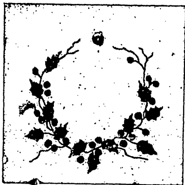
WATCH STAND DESIGN No. 25.

Green 256r, 2563 for leaves. In each instance the design is embroidered on white linen. When the embroidery is complete, wash and press, and cut out on the