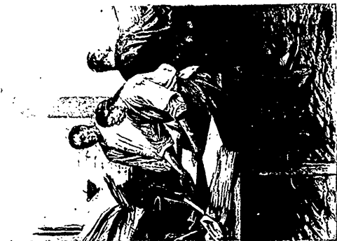
ILLUSTRATED LONDON NEWS. REPRINTING THE CHINESE CLASSICS.

for some time in our cities, with the electric trolley cars and the ever-evidence bicycle, and in Toronto, at