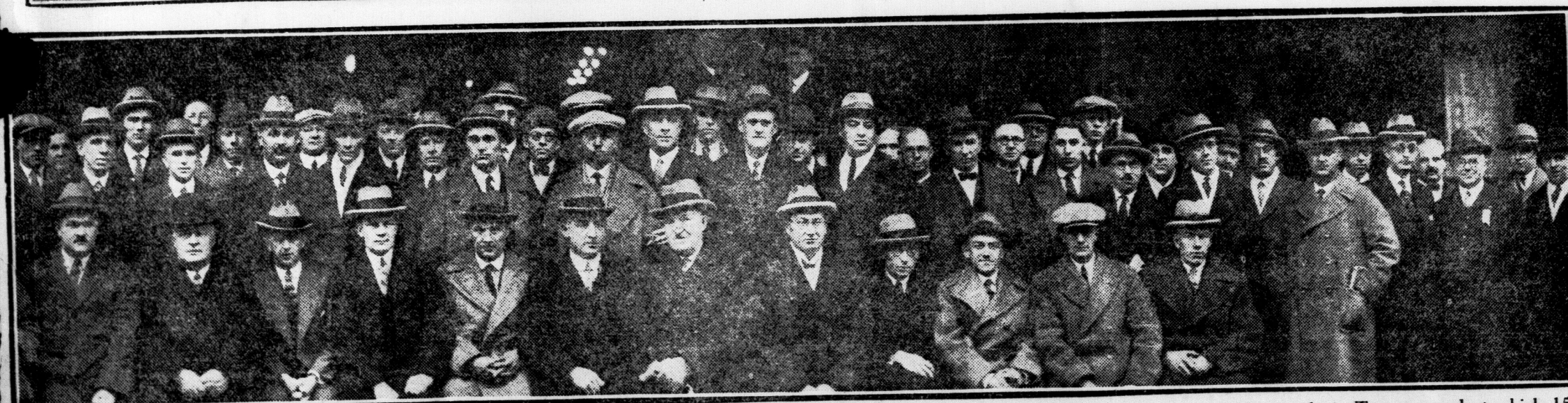
ONTARIO HOCKEY ASSOCIATION MOGULS —The above photograph shows a few of the delegates to the 36th annual O.H.A. convention held recently in Toronto, and at which 150 clubs were represented. The O.H.A. is the largest and most powerful hockey organization in the world.