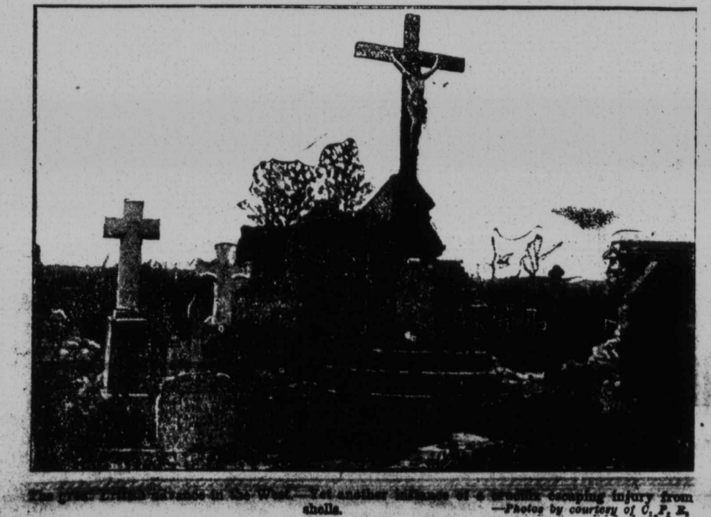
Another view of the cross, showing injury from shells.