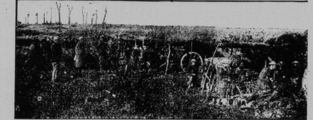
On the British Western Front in France.—A field battery in action.