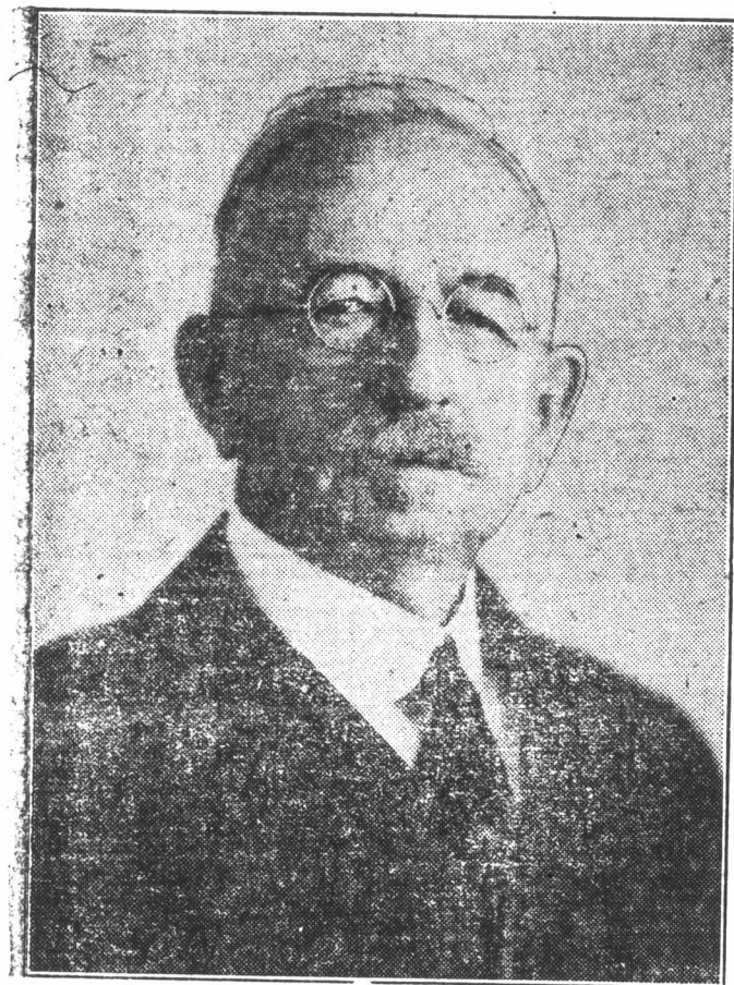
A new photograph of the LATE LORD SHAUGHNESSY, taken shortly before his death.

THE death of Lord Shaughnessy in Montreal, on December 10th, brought back into the public mind something of the history of those days, immediately following upon Confederation, in which Canada took her first strides towards nationhood. He was one of the last of that remarkable group of pioneers with imagination and the force of character to give it such a start towards realization as did the building of the Canadian Pacific Railway. Great men all, Lord Shaughnessy was as great a nation builder as any, but his personality lost nothing of its humanity as his greatness became more widely recognized.