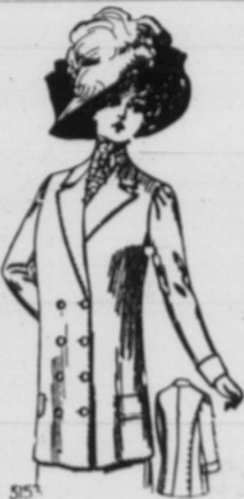
No. 5157—Ladies' Double-Breasted Coat. All Seams Allowed.

So we are looking out of a prison win- dow. But stay a moment. Is there no blade of green slipping from beneath its weight of stone? Just look about you a moment. Here are the dear ones that have been given to us. How we love them! Our very lives are twined about them. No evil has befallen them. The neighbor across the way has not been so blessed. Out yonder somewhere one of his loved ones is dreaming under the stars. Down the road there is a father and a mother who will go to bed tonight not knowing where the little girl who was once the light of their lives may be wasting herself.