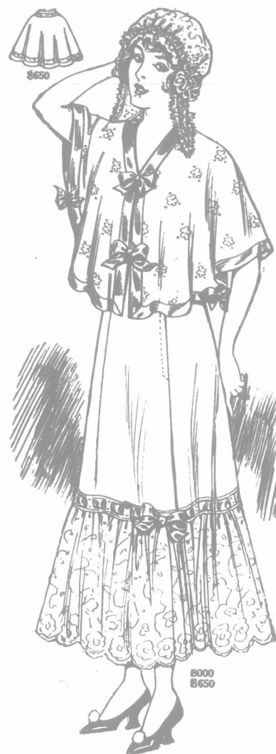
8650—Dressing jacket, consisting of one piece, one size.