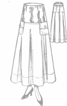
8691 Two- or Three-Piece Skirt with Yoke, 24 to 32 waist.