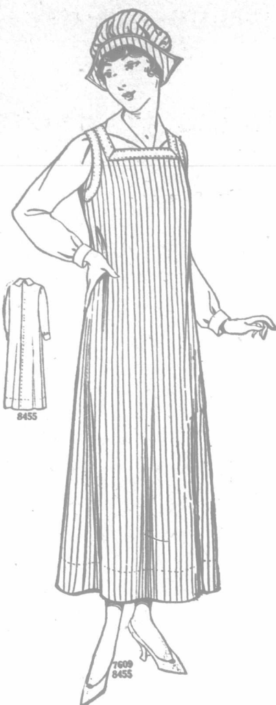
8455—Work apron, 34 to 44 bust.