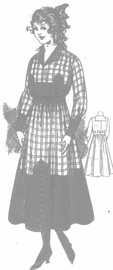
8826—One-piece dress for misses and small women, 16 and 18 years.