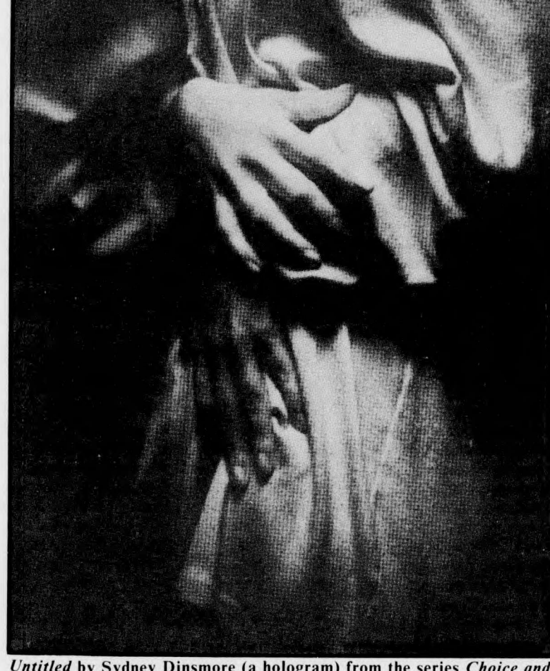
Untitled by Sydney Dinsmore (a hologram) from the series Choice and Circumstance

This is a relatively new medium, for the audience especially, as not too many people have been exposed to holography in an artistic context (credit-card holograms don't count). Thus it would take some time and experience to learn how to fully appreciate the medium.