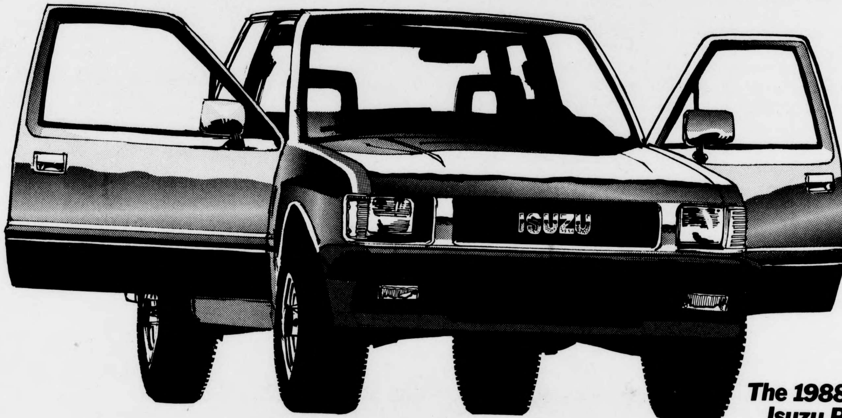
The 1988 Isuzu Pickup