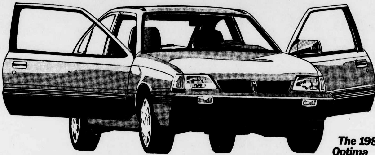
The 1988 Optima