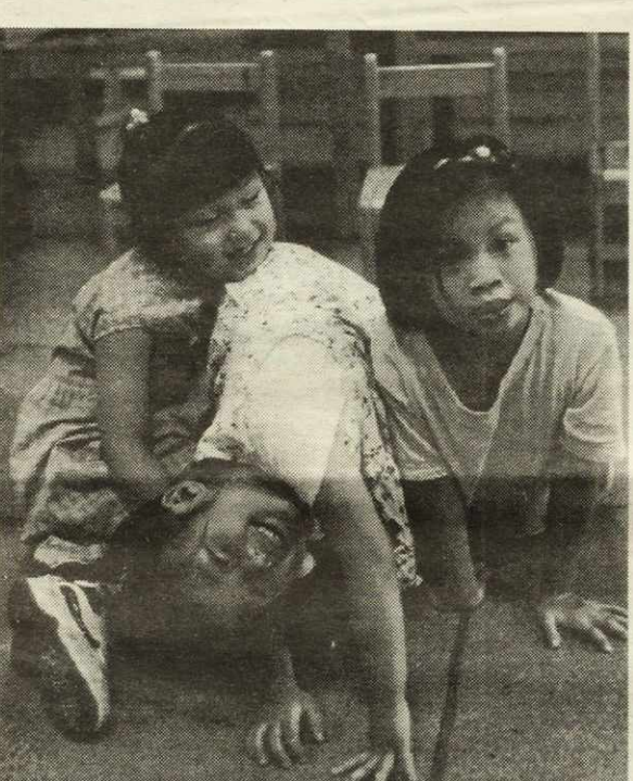
Sunshiny faces from a morning kindergarden class.

stick around not paying it off? Aaron Bleasdale is a Dalhousie graduate teaching English in southeast Asia.