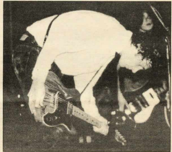
Even though our reporter missed them, Cool Blue Halo was there.