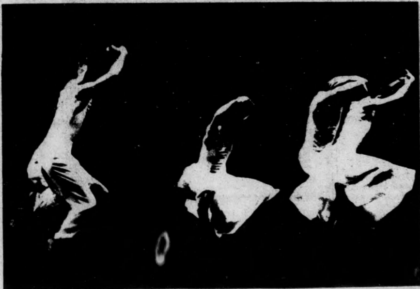
The joy of the dance: Les Grands Ballets Canadiens hoof it to the max.

Tonight and tomorrow night Fredericton is privileged to be able to host an exceptional dance group Les Grands Ballets Canadiens. Because of the thuggish nature of the entertainment staff we will rely on the learned opinions of