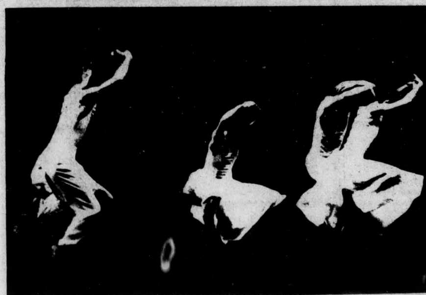
The joy of the dance: Les Grands Ballets Canadiens hoof it to the max

Tonight and tomorrow night Fredericton is privileged to be able to host an exceptional dance group Les Grands Ballets Canadiens. Because of the thuggish nature of the entertainment staff we will rely on the learned opinions of