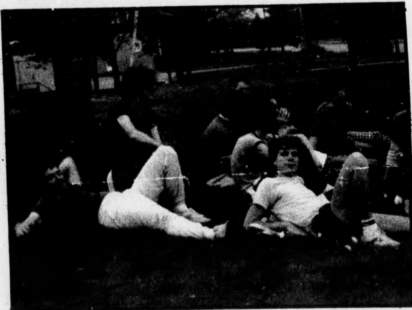
An apathetic bunch of death bunnies