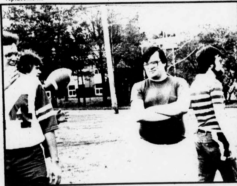
The Barbarians come up empty in the desperate search for Alleycats (center) legs