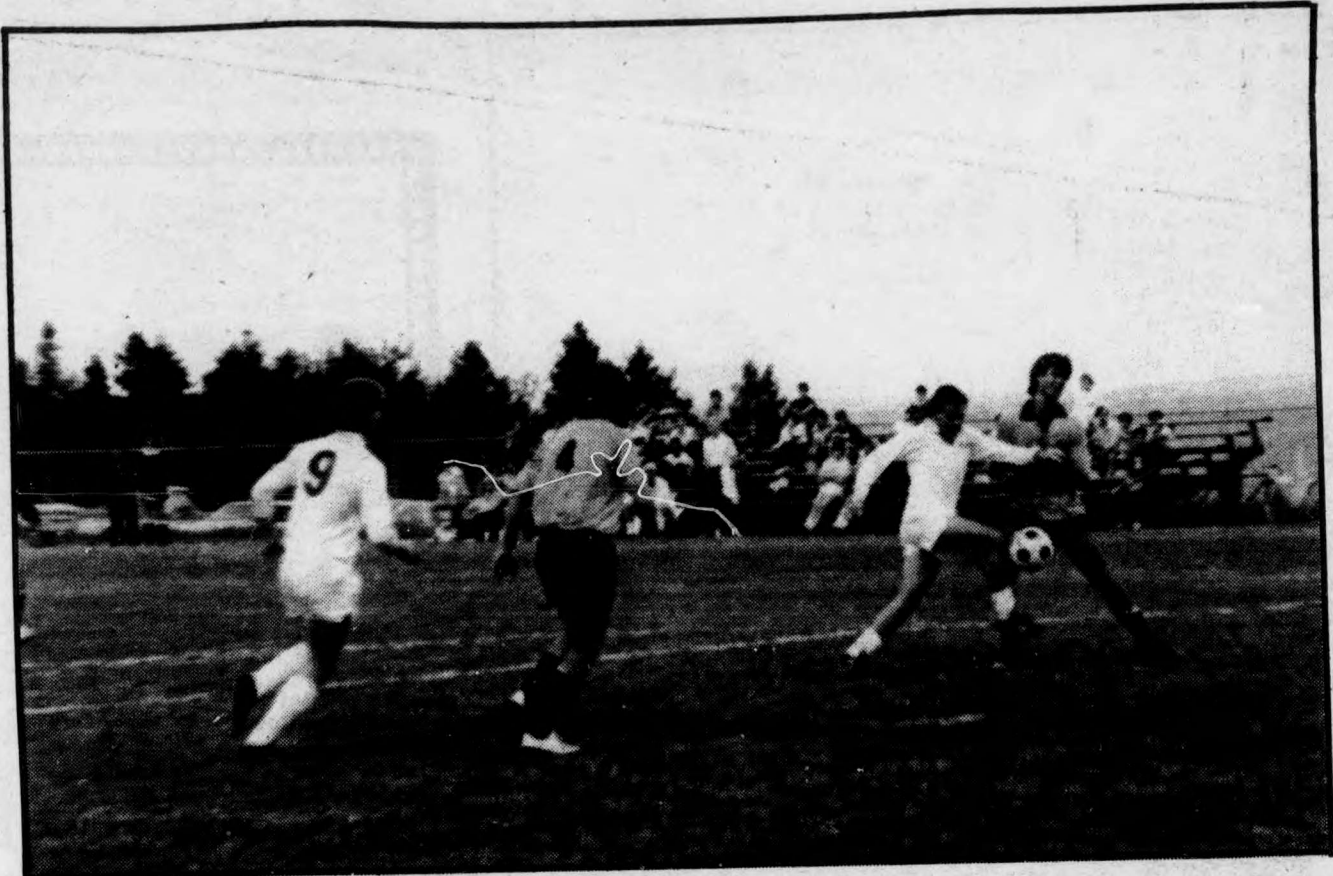
The U.N.B. Red Shirts on the move