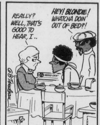
by Garry Trudeau