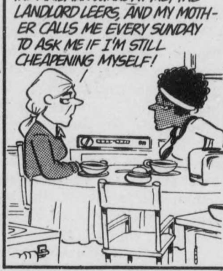
JOANIE, I'M NOT ANY HAPPIER ABOUT IT THAN