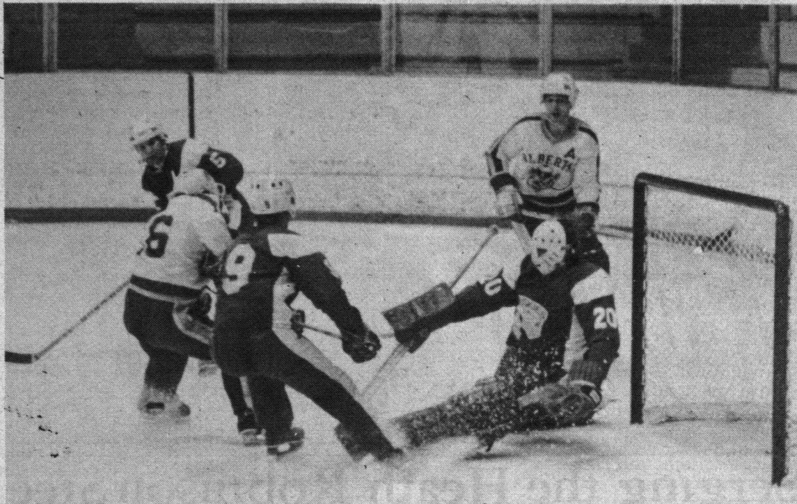
Bears are still hoping for the play-offs. UBC beat Calgary on Saturday.

Perhaps the key to the win was the fact that the Bears were able to get off to a good start and