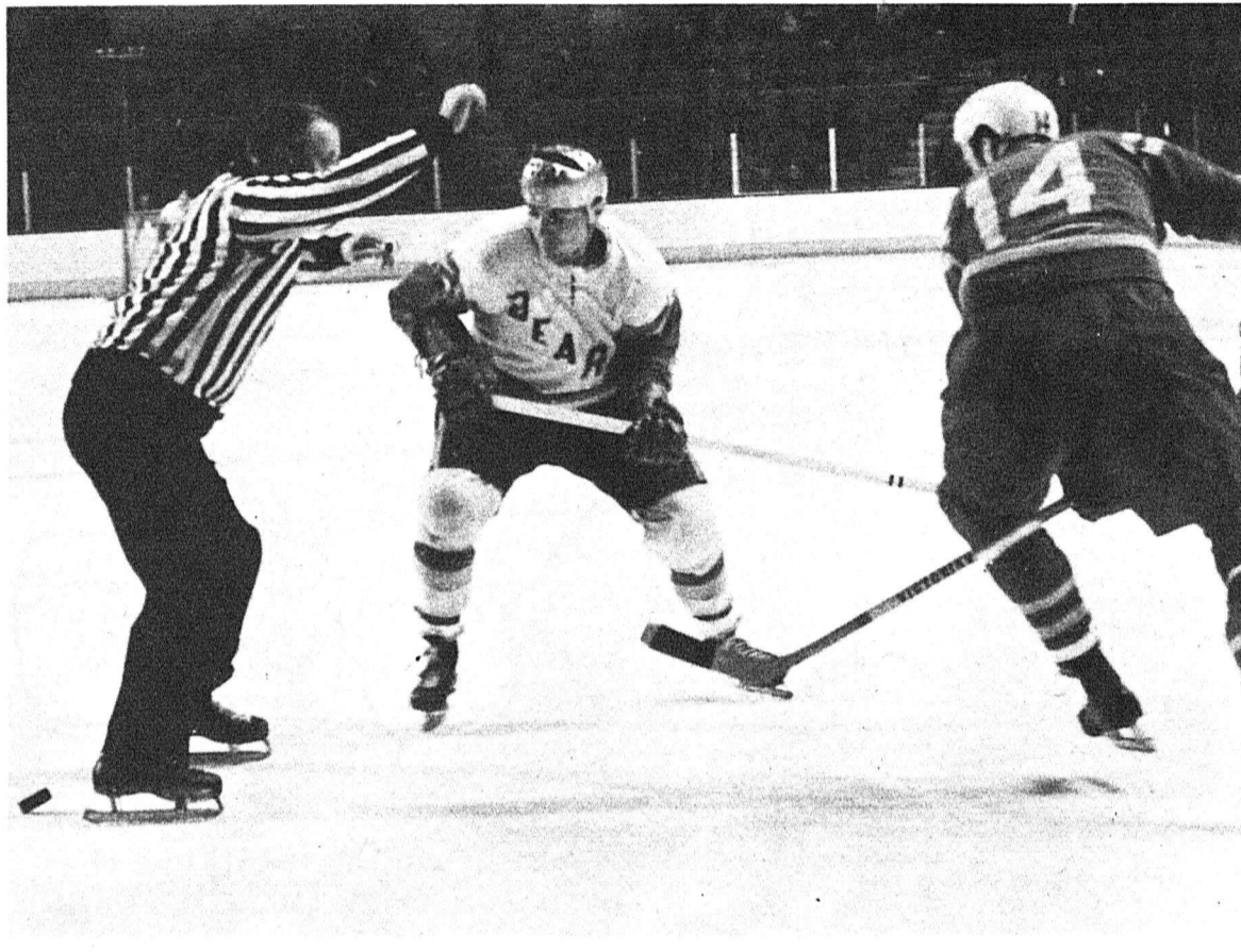
HIT ME AND I'LL CRY ... pity the poor ref trapped between puck and players