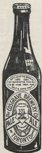
The ONLY Chill-proof Beer