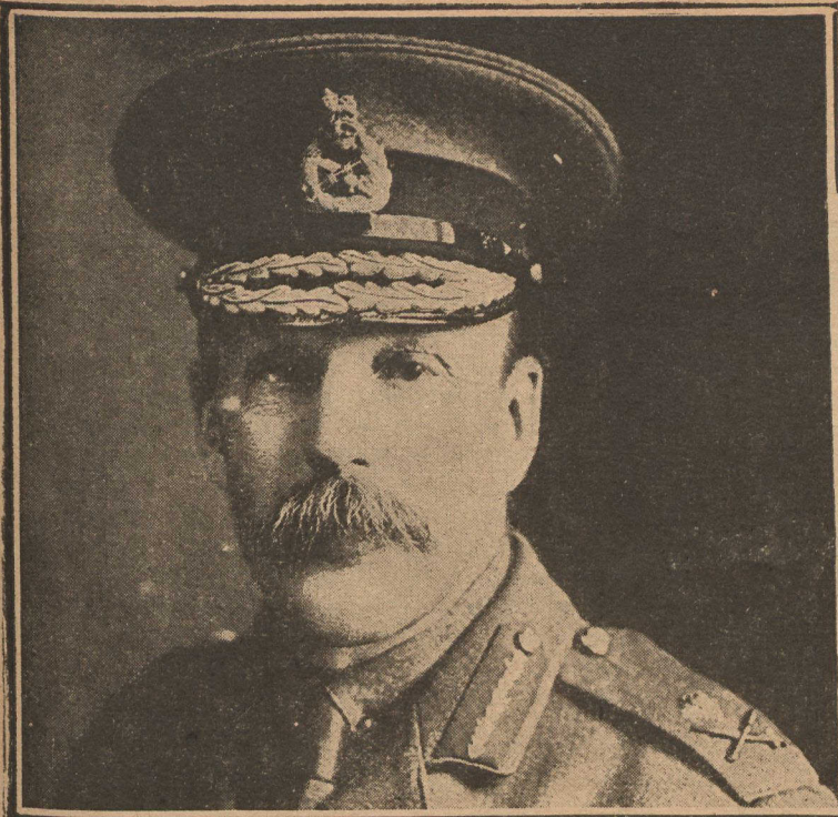
MAJOR-GEN. MAUDE, THE CAPTURER OF BAGDAD.