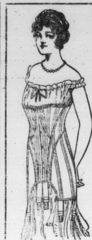
New Spring Models of a la Grace Corsets

People who have waited for more "reasonable prices" are buying now because the "quality" as well as the price is considered (by men who should know) to be at lowest now for some time.