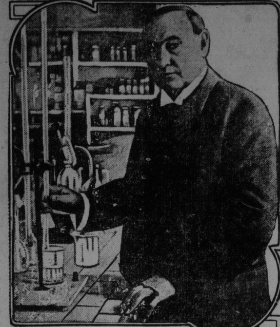
DR. HENRY W. WILEY.

Washington, Jan. 16.—The famous Dr. Harvey W. Wiley, chief of the Bureau of Chemistry in the Department of Agriculture, may remain in the Government service and may not. Gifford Pinchot occupied just such an uncomfortable position for several months, and then found himself on the pay roll. Dr. Wiley may be found fighting a perfect imitation of the Pinchot performance, except in point of eloquence. The doctor has ideas of his own which run counter to those of his superiors, but he has kept his criticisms to himself and certainly cannot be discharged for insubordination. As in the case of Pinchot, too, the people are "with" Dr. Wiley. They regard him as the friend of good health and the foe of impure food. As the Gifford Pinchot is the foe of the pure food law, the originator of the celebrated "poison squad," the name of Wiley will go down into governmental history like unto that of Gifford Pinchot in its relation to the saving of the forests. Just what the Administration can take to rid itself of this useful public servant without losing the use of his services is a question of great interest in Washington.