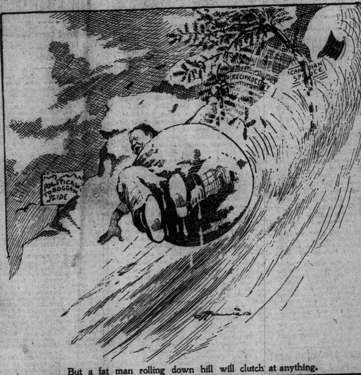
But a fat man rolling down hill will clutch at anything.