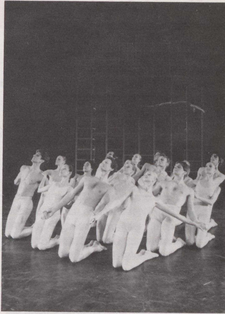
A scene from Findings, a ballet choreographed by Brian Macdonald.

The Far East tour has been two years in preparation. The company will take with them 4 000 tonnes of costumes, scenery, props and equipment. In addition to the costumes and scenery, they will be transporting 1 000 pairs of shoes for its 39 dancers, 150 rolls