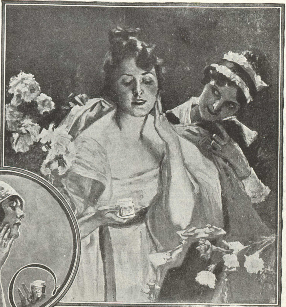
One application of Pond's Vanishing Cream makes your skin noticeably lovely