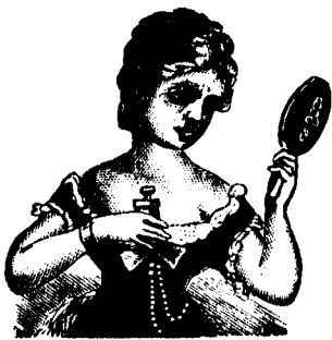
A skin of beauty is a joy forever.

ADDRESS, THE WEEK, 5 JORDAN ST., TORONTO.