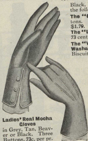
Ladies' Real Mocha Gloves in Grey, Tan, Beaver or Black. Three Buttons, 73c. per pr. 3 pairs for $2.13.

The "VALLIER."—Best Quality Washable French Kid, in White, Biscuit, Lavender, Greys, Pastel Beavers and Tans, 4 Pearl Buttons, 95c. Three pairs for $2.80