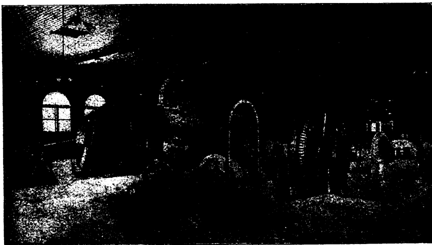
Two of our Engine Type Alternating Current Generators and Auxiliary Apparatus forming the Municipal Lighting Plant, Edmonton, Alta.

“Allis-Chalmers” Mining, Saw Mill and Flour Mill Machinery, Engines, Pumps and Turbines.