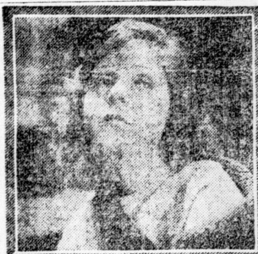
NORMA TALMADGE Norma Talmadge, supported by Eugene O'Brien in "By Right of Purchase," the sensational society drama at the Majestic Monday, Tuesday and Wednesday.

A third feature will be shown on the double matinee on Saturday, Mary Pickford, in "Rebecca of Sunnybrook Farm," one of her brightest, cheeriest pictures, will be presented on the bill. There will be four great stars on the program at the Majestic Monday, Tuesday and Wednesday, for the double matinee. Norma Talmadge and Eugene O'Brien will be shown both afternoon and night in the sensational society drama, "By Right of Purchase," and matinees on Elliott Dexter and Lila Lee will be shown in the great stirring drama of the northland, "The Daughter of the Wolf."