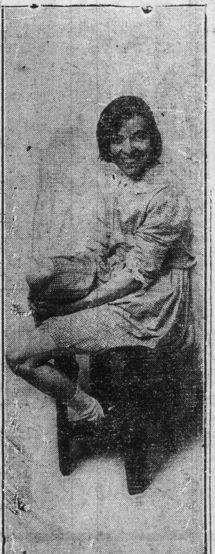
In Booth Tarkington's comedy "Seventeen" which comes to the Grand Opera House To-day.

The retail stores of the City will remain open until ten o'clock tonight on account of tomorrow being a holiday.