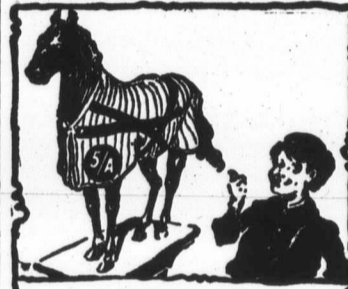
5-A BIAS GIRTH Horse Blankets Will keep their position on the horse. Can't slip or slide. Tight girthing unnecessary.

Going ahead by leaps and bounds—our Sale of