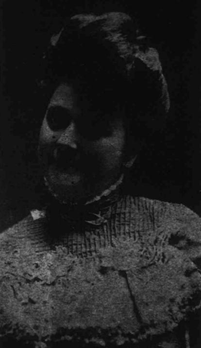
Dabster Disciplinarian of DANDY DOGS