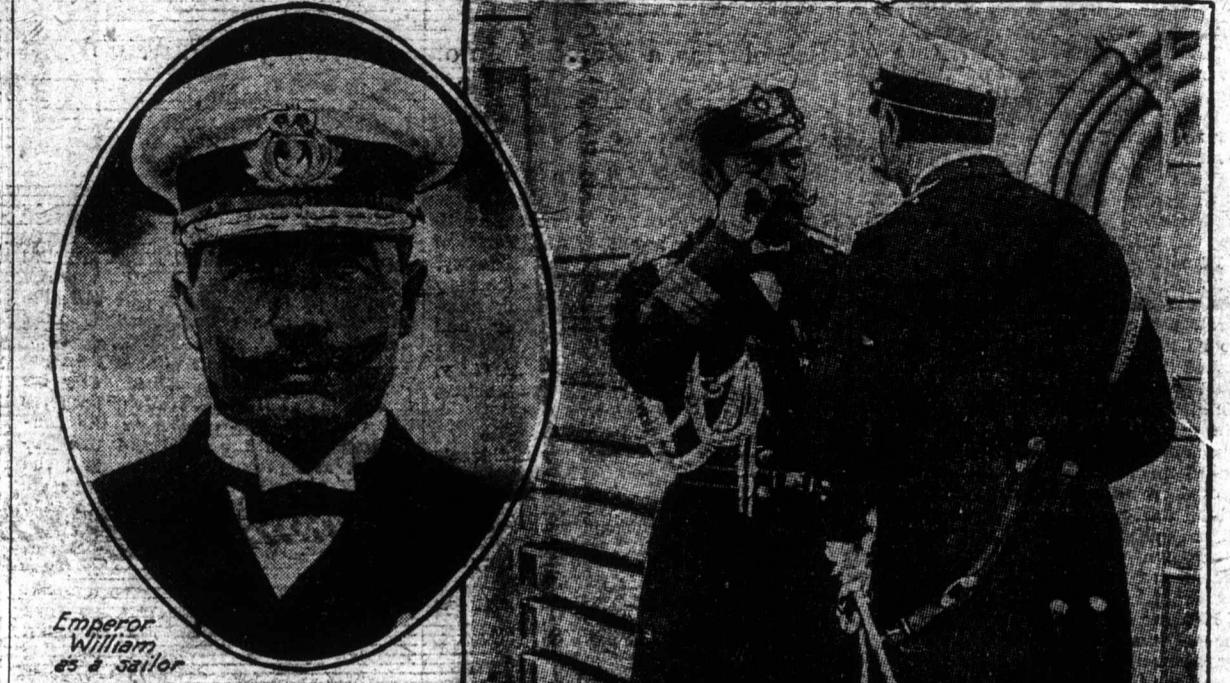
Emperor William and Czar Nicholas at sea