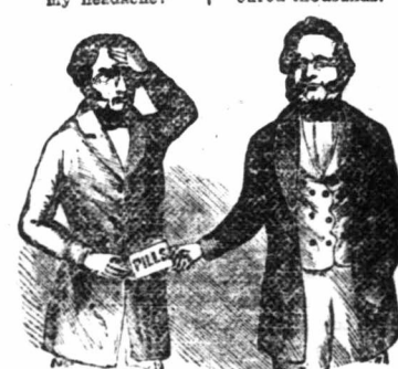
HEADACHE. HUTCHINS' HEADACHE PILLS,

Will your Pills care ! Yes: and they have my headache? oured thousands.