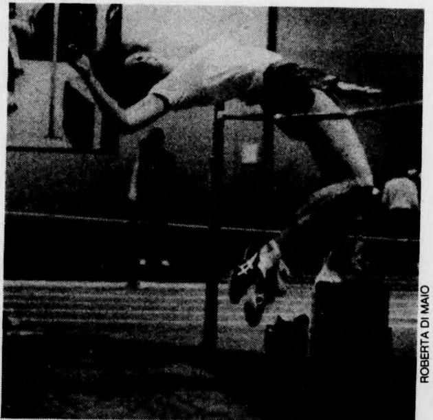
UP BUT NOT OVER: A high jumper is caught moments before she knocked the bar from its rest.