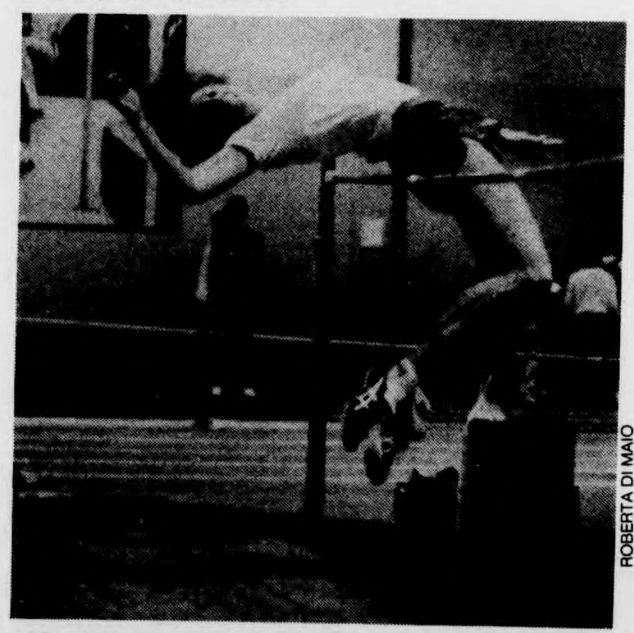
UP BUT NOT OVER: A high jumper is caught moments before she knocked the bar from its rest.