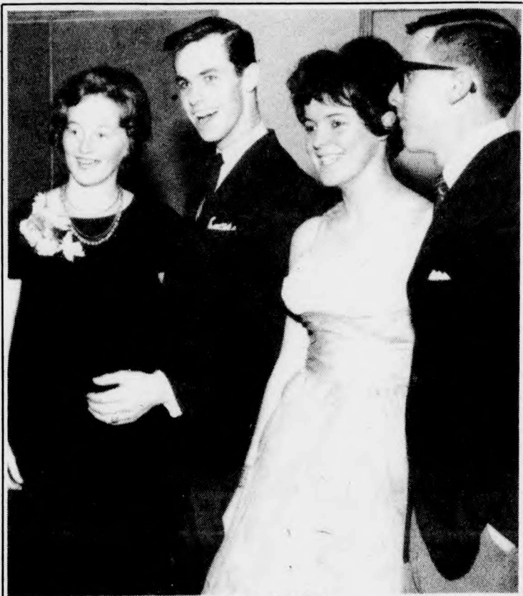
York students enjoy the University's early days

Although dates and details have not been finalized for many of the 20th Anniversary events, the following are some of the activities being planned. Further details will be published as they become available. For more information about any of these events, please contact the Coordinator of the 20th