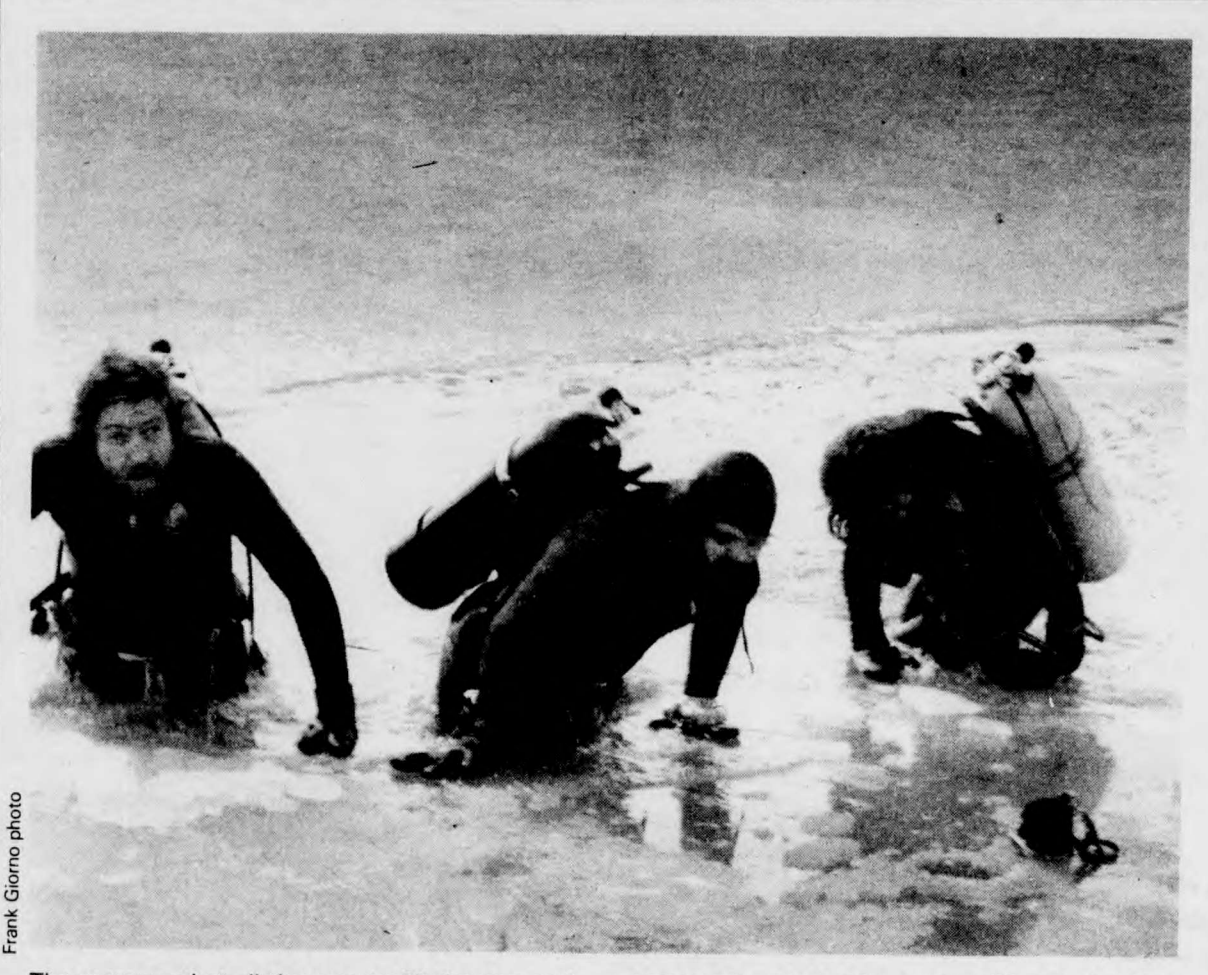
The mercury shot all the way to 60 degrees and more last week, so these three Stong students decided to cool off in the still chilly waters of their

For both players and fans it was a just frustrating anti-climax to a successful season, but one which, unfortunately, was just not successful enough.