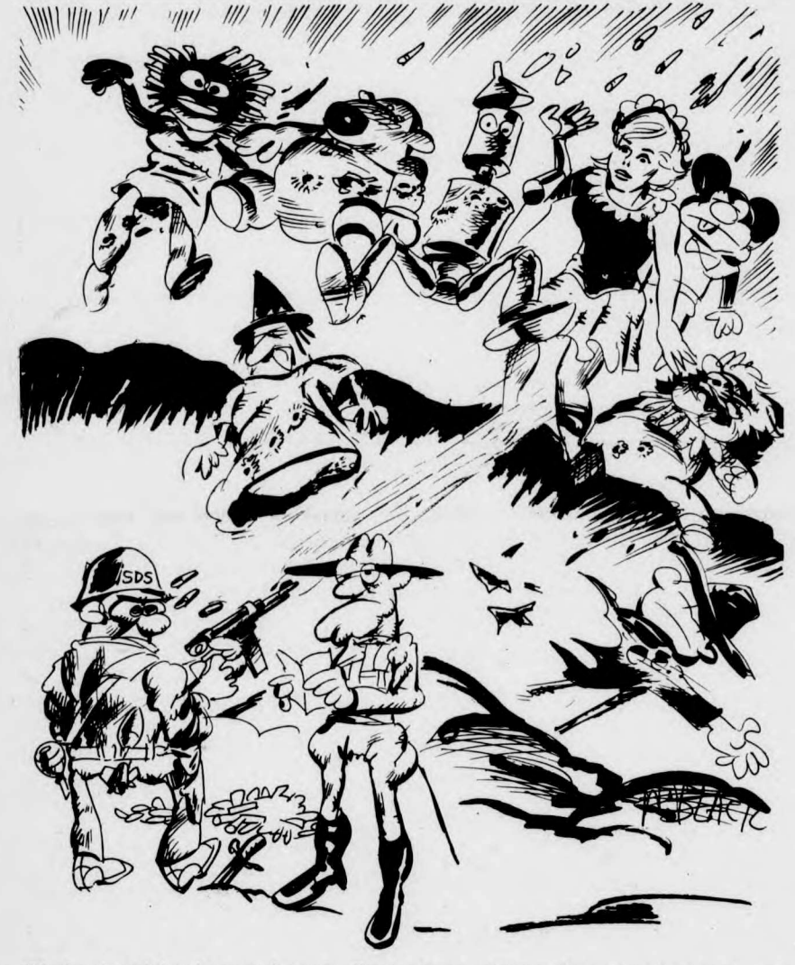
"If the Lord had meant us to listen to a million offensive theories, he wouldn't have given us freedom of speech."