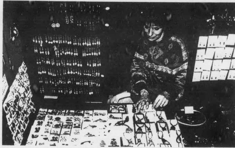
Just some of the wares for sale at Christmas Choice '95