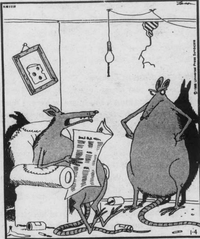
"Clean it up? Clean it up? Crimony, it's supposed to be a rathole!"