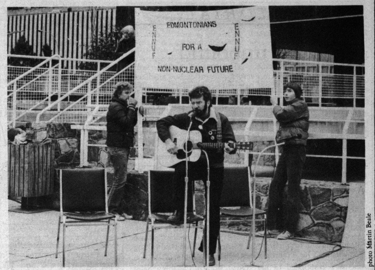
On Saturday, October 24, about 200 people congregated at City Hall to usher in UN Week

The Hyde Park agreement was made between the United States and Canada during the "The greater problem I see Second World War, Canada could itself and the U.S.