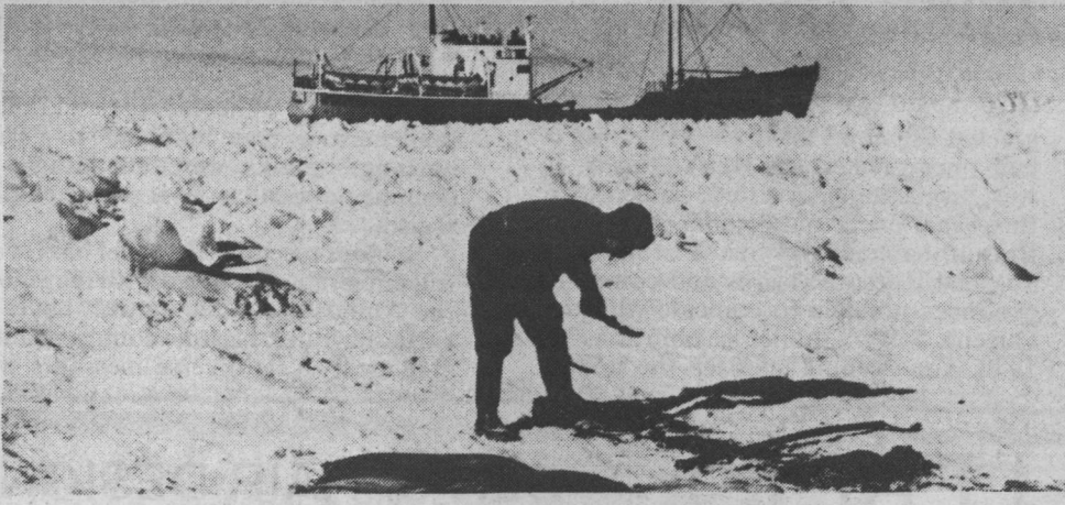
A sealer separates pelts from carcasses on an ice floe at the hunt site

The protest should switch to Europe where the pelts are purchased. That would be the best place to begin an effective protest," says Stirling.