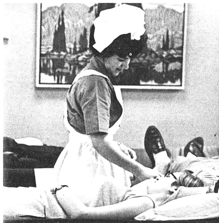
A VESTAL VIRGIN