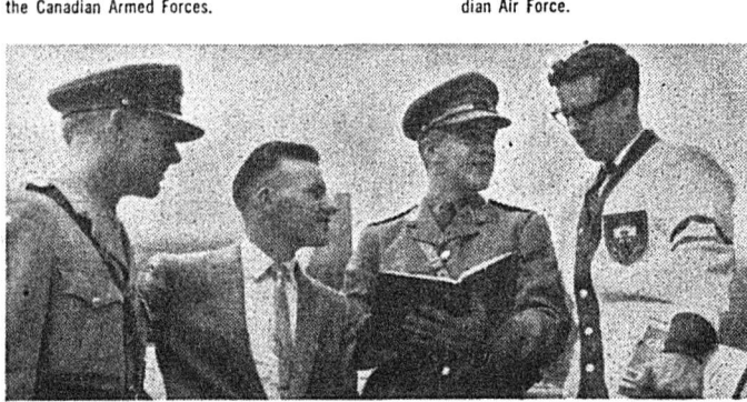
THE CANADIAN OFFICERS' TRAINING CORPS—University undergraduates may obtain a commission by training during their spare time and summer holidays. The student who trains under this plan is paid for his actual training time and is not obligated for full-time service after graduation.