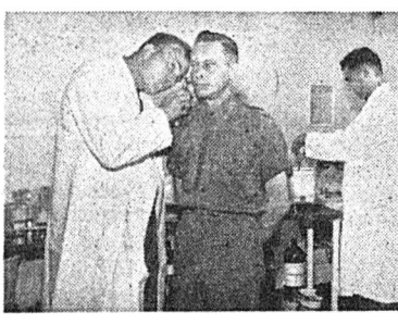
SUBSIDIZATION FOR PROFESSIONAL TRAINING - There are tri-Service plans wherein university students in medicine or dentistry can be subsidized during their course and become commissioned Doctors or Dentists in the Canadian Armed Forces.

Here are four interesting and rewarding plans for young men interested in a career as a commissioned officer in the Canadian Army: