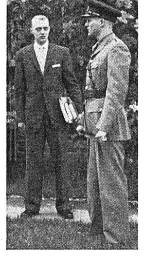
THE OFFICER CANDIDATE PROGRAMME-THE OFFICER CANDIDATE PROGRAMME— Selected high school graduates, not wishing to undergo academic training for a degree, may qualify as a short service officer after a brief intensive period of military training and later may apply to become a regular officer.