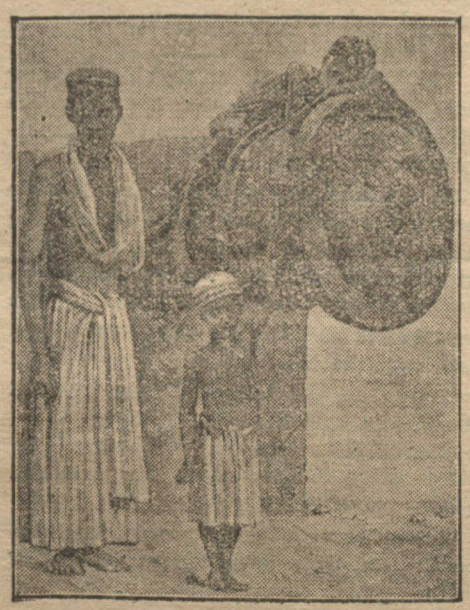
THE DUST OF OLD DACCA-AT THE CANNON'S MOUTH.

Where it came from originally no man seems to know. The oldest records of the city do not tell us, and the almost obliterated designs on the metal itself fail to give a clue. Some facts, however, have been ascertained. There were two guns, and they stood in front of a palace built