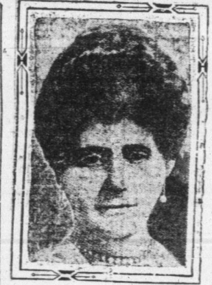
PRINCESS RADZIWILL, Whose deputation from Western Canada, where she has been delivering addresses has been asked for in the House at Ottawa.

Some people are surprised that INSTANT POSTUM is so delightful and satisfying. Try it.