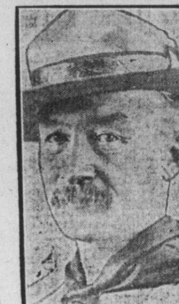
MAJOR GENERAL SIR ROBERT BADEN-POWELL.—Head the Boy Scouts' movement, who arrived on a tour of Canada.