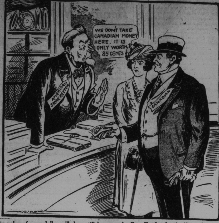
The value of your dollar will drop still lower under Free Trade, that is, if you have any dollar left.