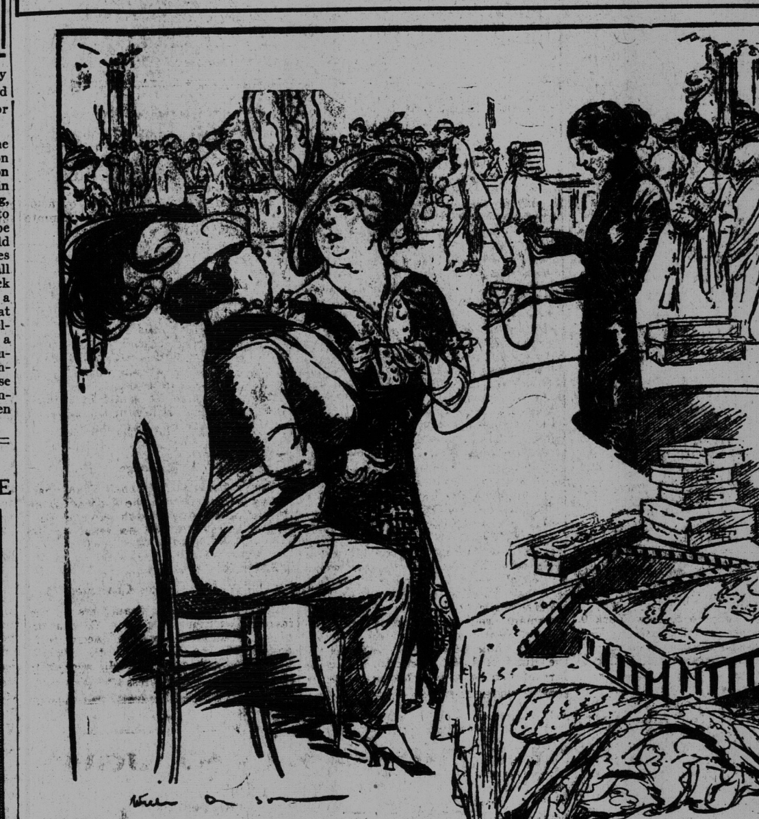
(Conversations that tired store girls sometimes hear)—Fancy, dear, this stupid creature taking so long to match a simple ribbon for my bathing suit, and me so run down that the doctor insists upon two months at the seaside for me!